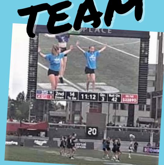
2023 Redblacks game

Athletes will work on routines, including poms, dance and synchronized line routines ready for community events. Pom, jazz and acro training will be part of the classes.